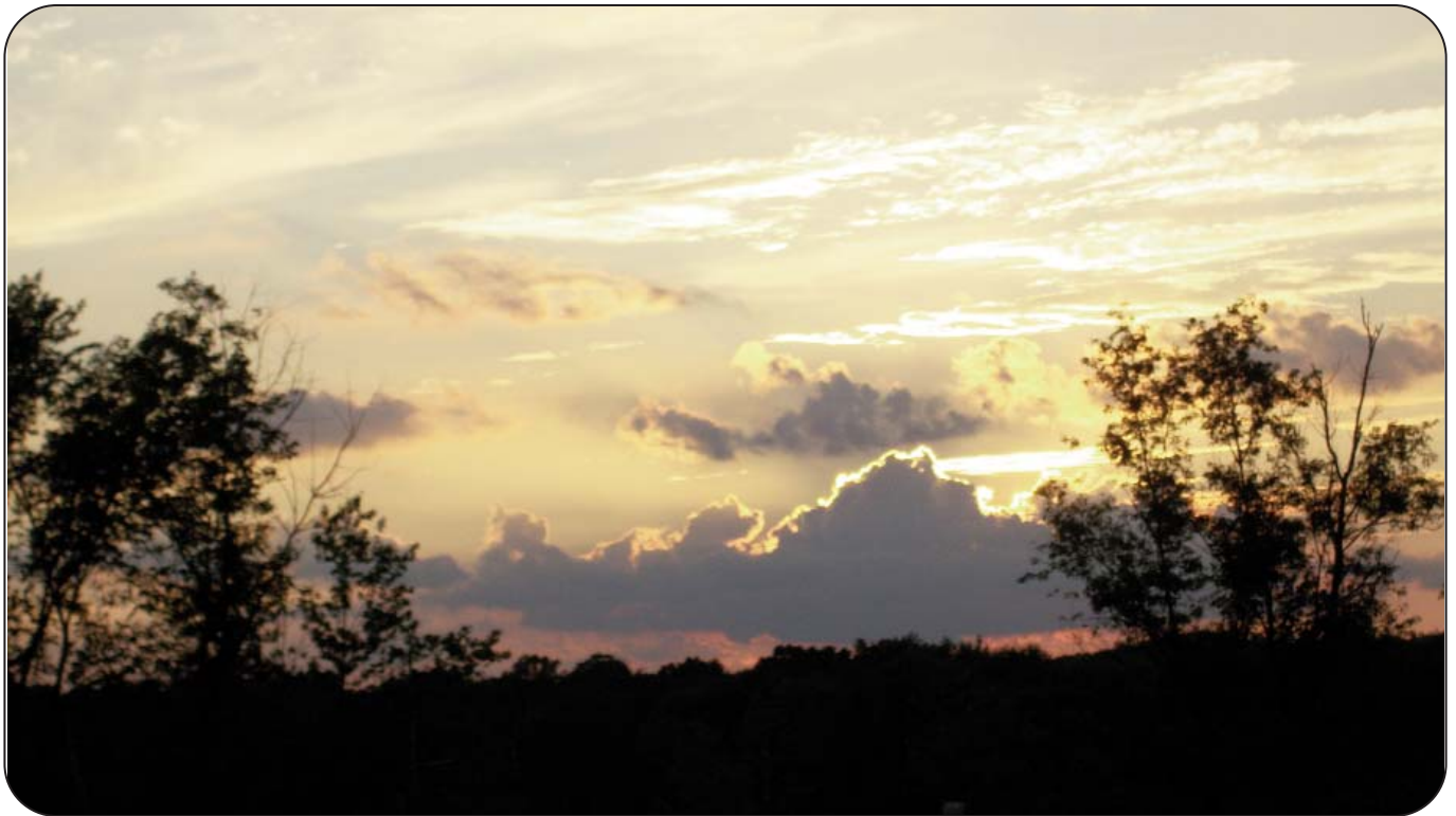
Sunset at Ottawa Wildlife Refuge

Non-Profit Org. U. S. Postage PAID Permit No. 133 Mukwonago WI 53149