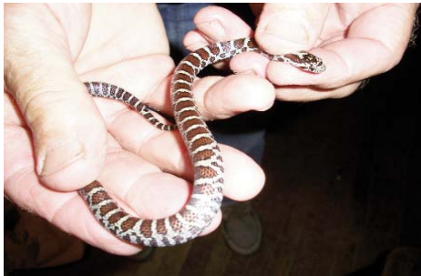
Marlin holds a Milk Snake.

In addition, many volunteers went beyond reptiles and amphibians and reported other animals they saw in the minnow traps: 2" long predaceous diving beetles and giant water bugs, leeches, crayfish, mud minnows and sticklebacks (These fish are predators on salamander and frog eggs. They sometimes get into shallow ponds during spring floods but die when the ponds dry out.) Besides snakes, the snake boards attracted meadow voles, deer mice, shrews, crickets and beetles.