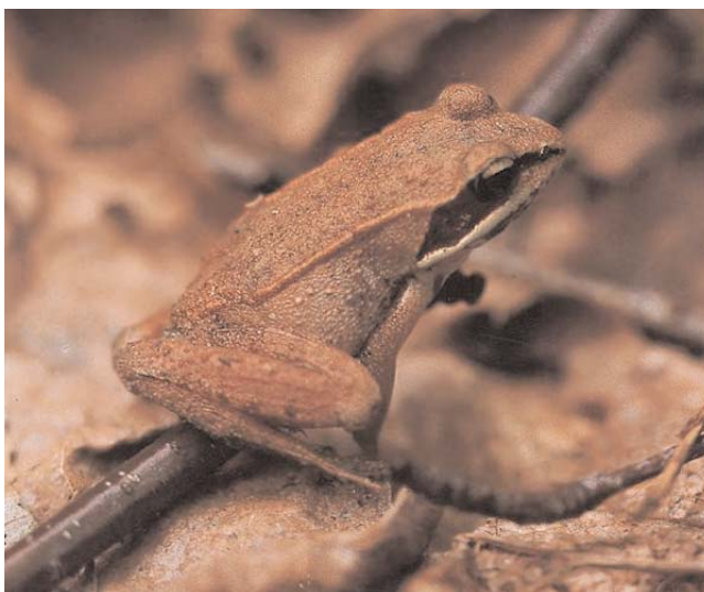
Wood Frog ( Rana sylvatica )