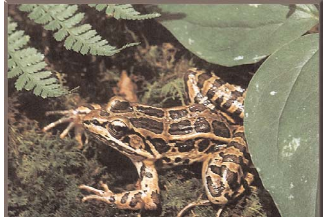
Pickerel Frog ( Rana palustris )

Spring peepers can be recognized by their small size and irregular dark "X" on the light tan to brown back. Like other tree frogs, peepers have slightly enlarged toe pads which allow them to grip and climb on vertical surfaces. The call is a very shrill repetitive 'peep', which, on some rainy nights, can be absolutely deafening.