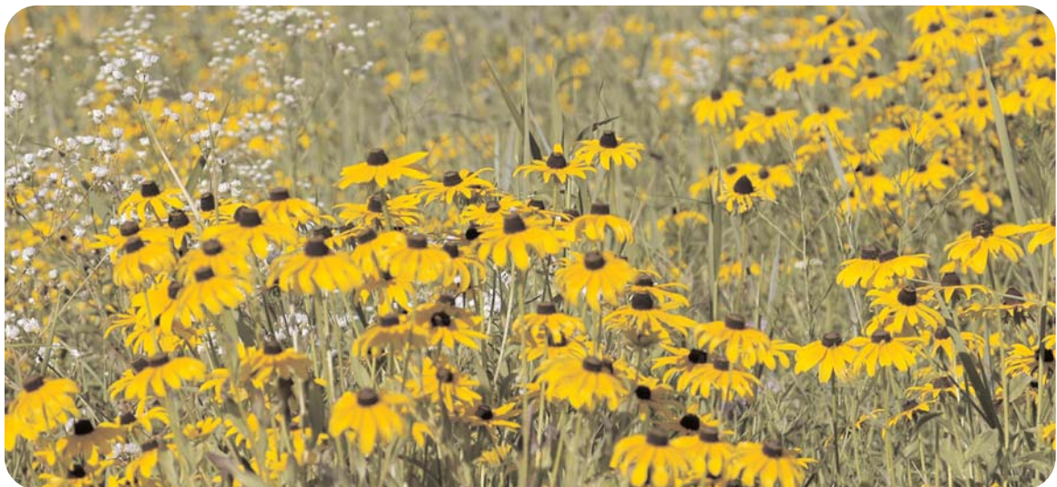
Black-eyed Susans bloom in Eagle Centre Prairie