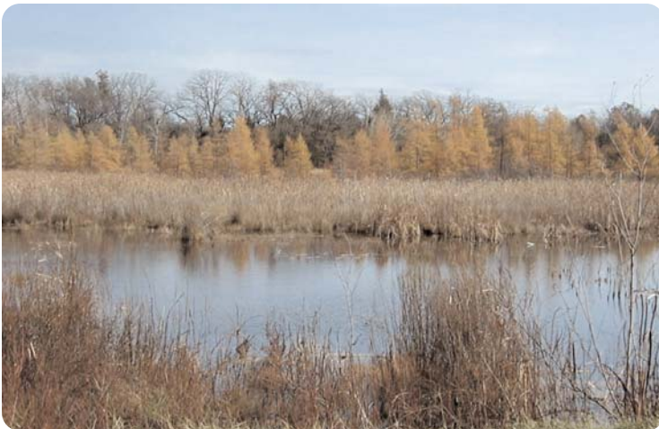
Fall's golden Tamaracks glow on an island in the Wilson Wood Duck Sanctuary.

Non-Profit Org. U. S. Postage PAID Permit No. 133 Mukwonago WI 53149